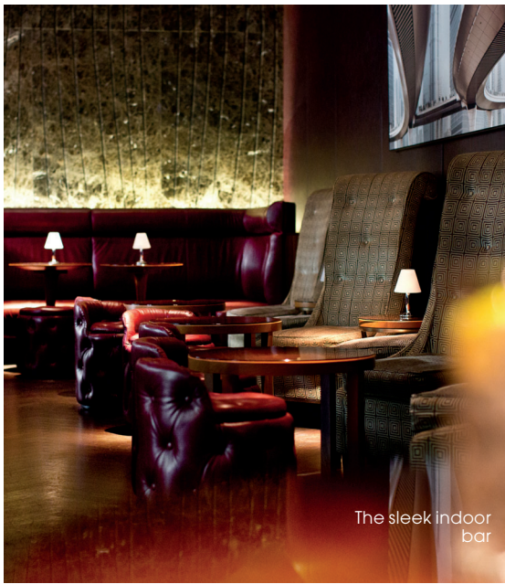
The sleek indoor bar