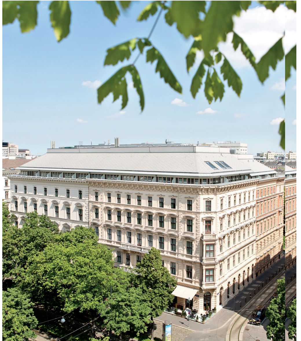
ABOVE: An exterior view of The Ritz Carlton, Vienna BELOW: A bright and contemporary bedroom; the hotel's indoor pool

Glittering jewelry is abundant in Vienna's "Golden U" shopping district- comprising Kohlmarkt, Graben and Kärntner streets. Gadner and Schullin are two famous Austrian jewelry houses located along the Golden U, and there is something for everyone amongst their dazzling gemstone-encrusted creations. The Dorotheum auction house, founded by Emperor Joseph I, has been an eminent Viennese institution for more than 300 years. Located in a former convent turned palace, a stop at the Dorotheum's elegant salons and showrooms is unmissable for anyone interested in procuring valuable art or antique jewelry.