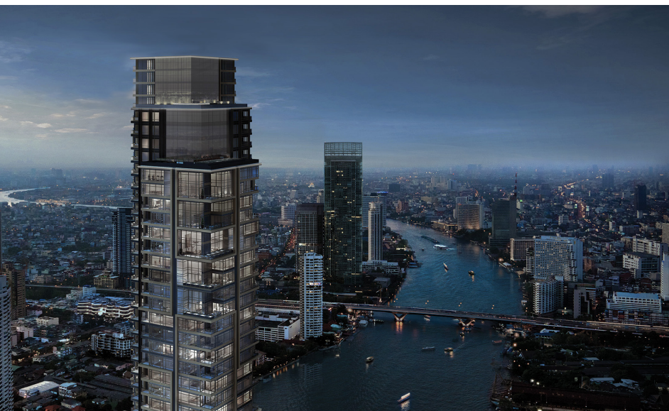
An aerial view of Bangkok