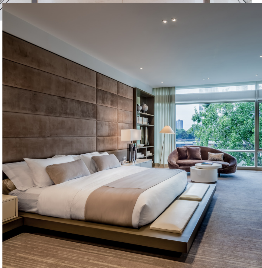
Sleek and contemporary interior design at the Four Seasons Hotel Bangkok

bedrooms to penthouse suites, all boasting ample living spaces with a luminous, airy design. Only high-quality materials and top-of-the-line appliances will be used in the project, in line with Four Seasons standards, but what really set the project apart are the amenities available to residents. A private lounge along the waterfront promenade will be an ideal venue to entertain guests or enjoy a relaxing evening meal, while an amenities deck on the third floor will feature an infinity pool surrounded by private cabanas, a fitness center, and a multipurpose function room where residents can hold gatherings or banquets. Finally, the exclusive triplex Four Season Club will offer such novelties as a golf simulator, a cigar lounge, a hangout room for children and teens, a private film screening room and Bangkok's tallest residential infinity pool on the 66th floor.